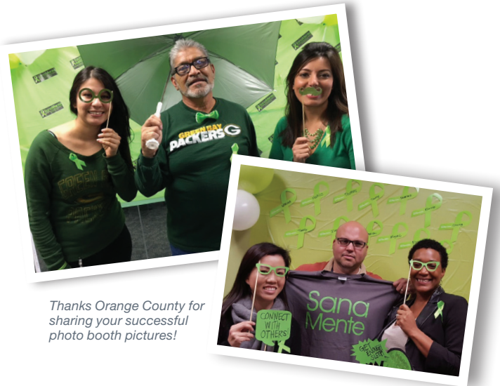
Thanks Orange County for sharing your successful photo booth pictures!

*Winners must live in the United States.